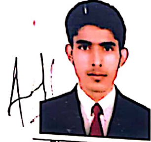
Photograph of the Candidate